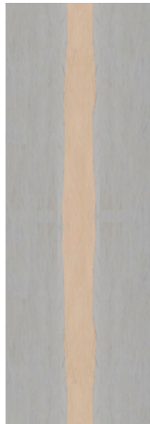
CUSI 3 - BRAZING